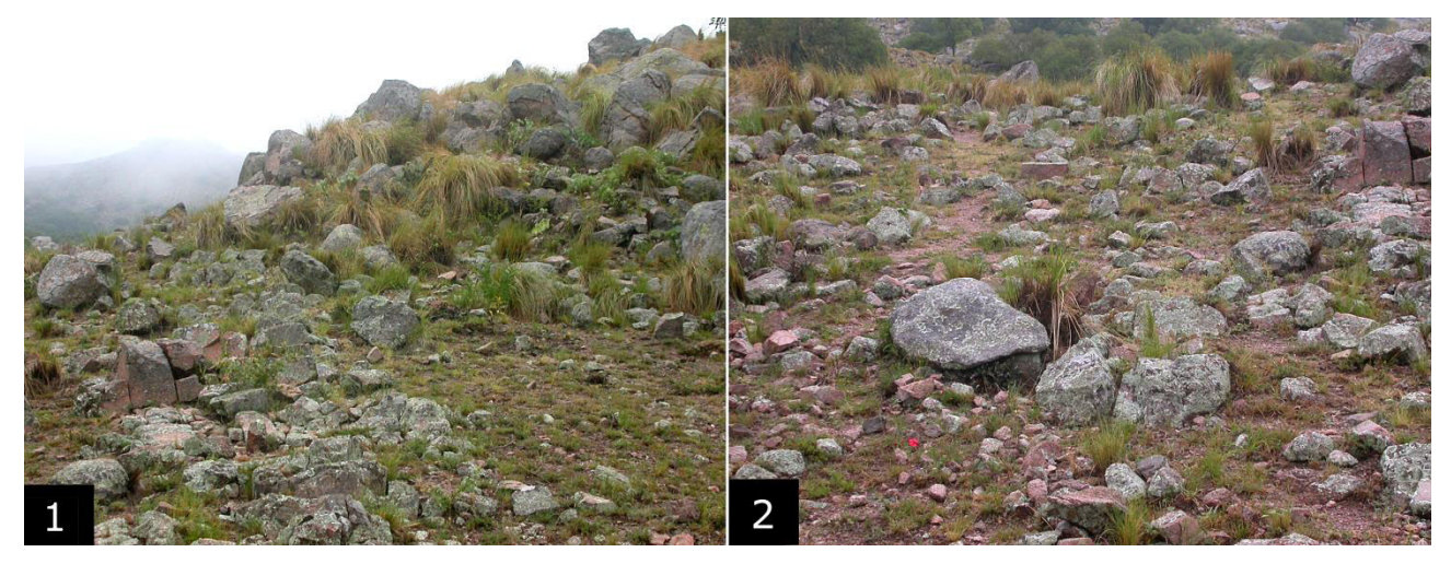
Figs 1–2. Sierra de Quintana, 1440 m. Rocky habitat with mountain pampa vegetation. Large rocks of grey granite and small stones of pinkish granite.

reached a kind of plateau with pastures, and from here we followed the indication for the Cerro de los Condores. After a few more km, at 1440 m altitude, we spotted a different habitat, with slightly pinkish granite. It looked very promising, so we stopped.