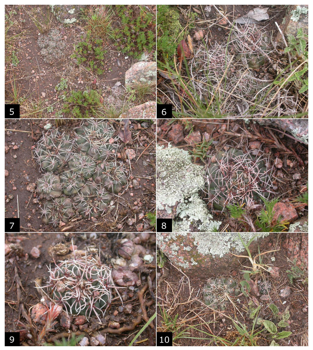
Figs 5–10. Gymnocalycium kroenleinii subsp. funettae MM977. Plants in habitat. Some small clumps were present, apparently not caused by many-headed regrowth after damage.

It was an exciting discovery on a fantastic trip, during which we had also found G. esperanzae , then unknown, and several other previously unknown populations of various species. A bottle of good wine, particularly appreciated in the fog and rain, was our much deserved reward!