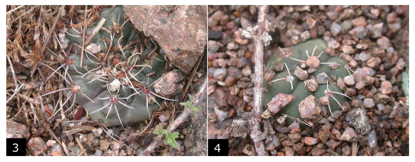
Figs 3–4. G. kroenleinii subsp. funettae MM 977 in habitat. Plants were in full growth after much rain, in small gravel of pinkish granite.

Soon after starting the search, we found the first specimens of a Gymnocalycium clearly belonging to the subgenus Gymnocalycium . From the generality of its characters we had no doubts that it belonged to G. kroenleinii , at least in a broad sense. We spent much time there, in spite of the cold and rainy weather. The population was quite rich in plants, and we could observe the variation in spination and body shape.