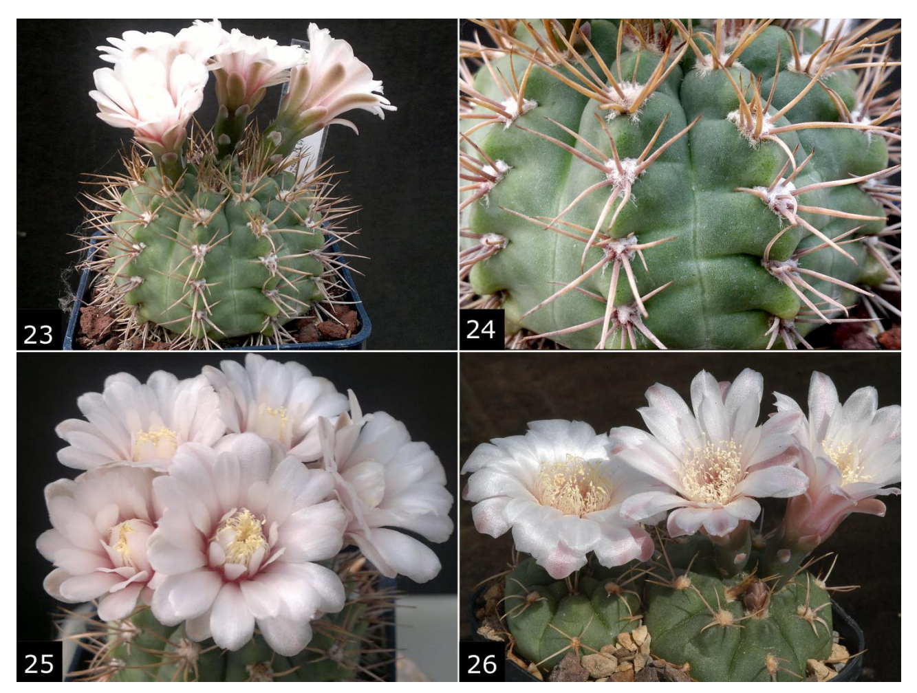
Figs 23–26. Gymnocalycium kroenleinii subsp. kroenleinii WR805 in cultivation.

DISTRIBUTION . The subspecies is native to the mountain range northwest of Olta, above 1300 m, and it is probably restricted to this Sierra. Based on our observations, the rocky habitats with quartz rocks where this taxon lives seem to be quite widespread along the higher slopes of the Sierra de Quintana, and it is thus probable that G. kroenleinii subsp. funettae can be found in most of the areas where the substrate offers suitable conditions.