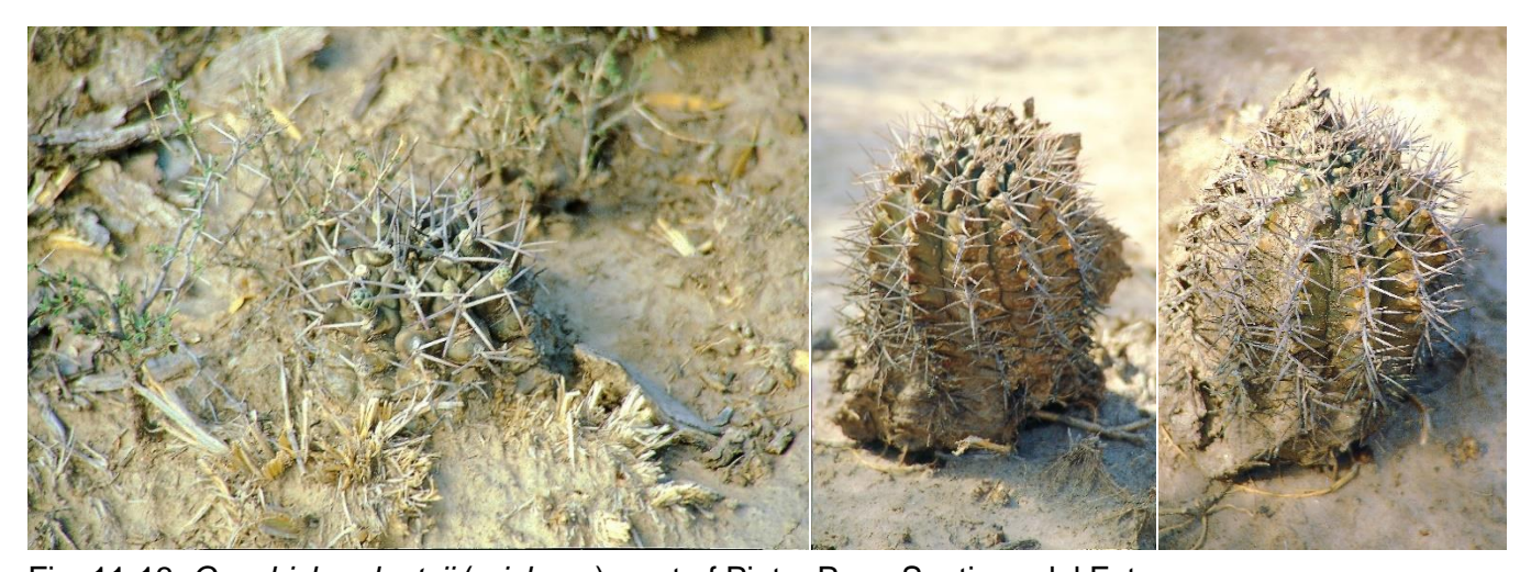
Fig. 11-13: G. schickendantzii (michoga) west of Pinto, Prov. Santiago del Estero.

This G. schickendantzii type can also be found farther to the east on Ruta National 9 between San Gregorio and Rio Salado. Along this section of the road masses of cacti are collected by the local people and put up for sale at the roadside. (fig. 17-20).