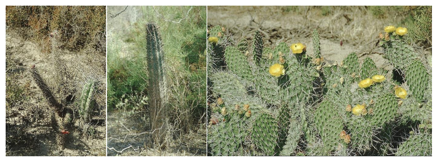
Fig. 14-16: Cleistocactus spec. (left), Echinopsis leucantha (centre), Opuntia aff. sulphurea (right).