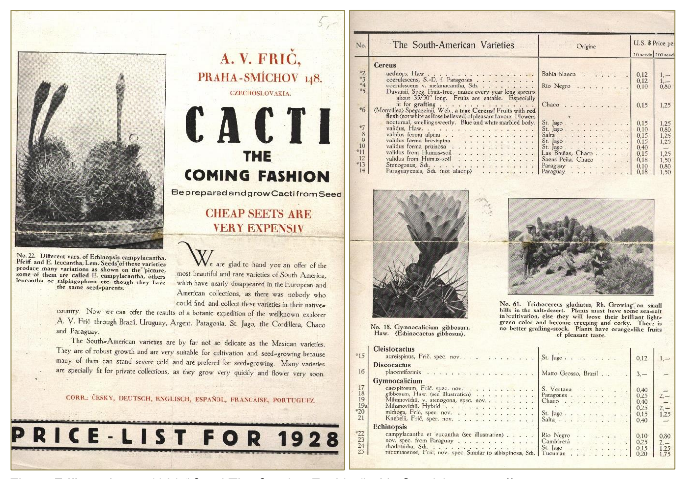
Fig. 1: Frič catalogue 1928 "Cacti The Coming Fashion" with G. michoga on offer.

In 1928 Frič offers under seed item 20: Gymnocalycium michóga , Frič, spec. nov. (fig. 1) in his catalogue " Cacti The Coming Fashion " for the first time. Its locality is referred to as St. Jago (Province Santiago del Estero) (Frič 1928). On account of a lacking description this name is a nomen nudum. Frič found this plant during his seventh tour of Latin America between January and June 1927. A letter of June 13<sup>th</sup>, 1927, to the editor of the Prague magazine " Praktischer Berater für Wohnungs- und Kleintierhaltung " (" Practical guidebook for indoor cultivation and animal keeping ") gives a short summary of this journey. The letter was written in Buenos Aires (Crkal 1983: 159).