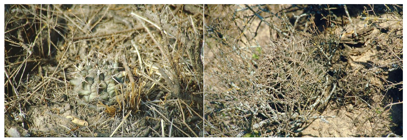
Fig. 7-8: G. schickendantzii (michoga) south of Colonia. Dora, Prov. Santiago del Estero.