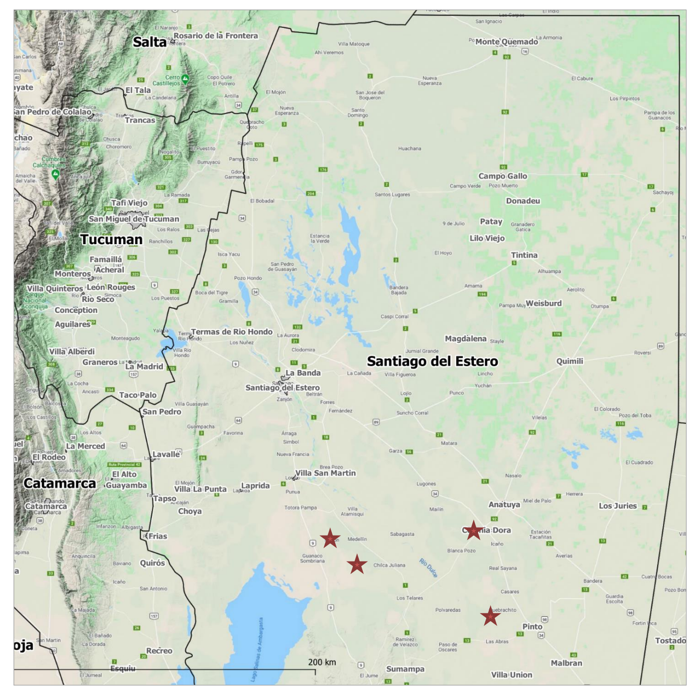
Map 1: Author's localities of G. michoga