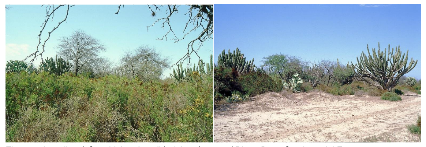
Fig 9-10: Locality of G. schickendantzii (michoga) west of Pinto, Prov. Santiago del Estero.