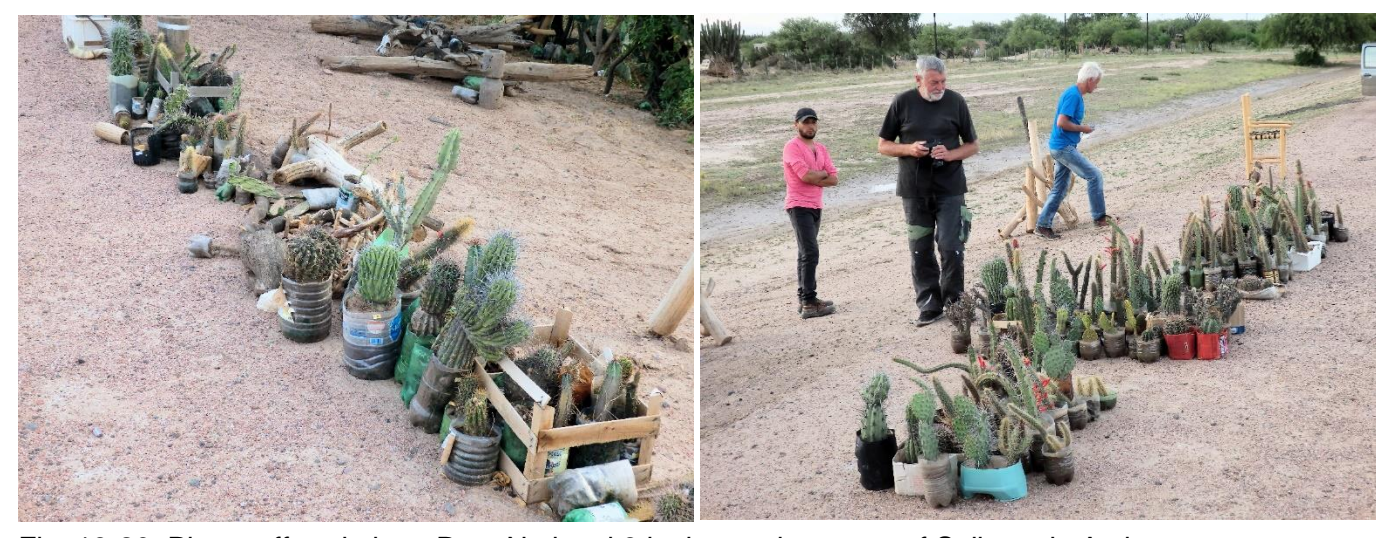
Fig. 19-20: Plants offered along Ruta National 9 in the northern part of Salinas de Ambargasta.

Till and Amerhauser refer to two proof specimens from the herbarium of Tucumán University. These originate from the utmost north of Province Santiago del Estero, not far from the border triangle Salta-Tucumán-Santiago del Estero. The localities mentioned (Est. Rapelli und Cerro del Remate) are approximately 300 km away from Colonia Dora.