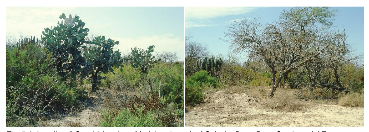
Fig. 5-6: Locality of G. schickendantzii (michoga) south of Colonia. Dora, Prov. Santiago del Estero.